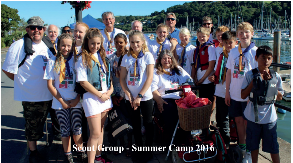
Scout Group - Summer Camp 2016